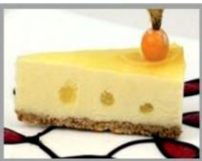
Tangy Lemon Curd Cheesecake 1 x 16 (Pre/Ptn) £18.90 £1.18