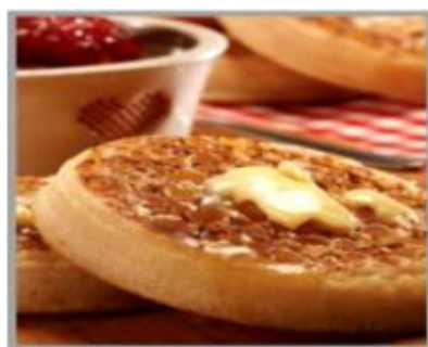
Crumpets 9 x 8 £10.50 £0.15