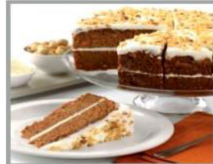
Carrot Cake Gluten Free 1 x 14 (Pre/Ptn) £14.90 £1.06