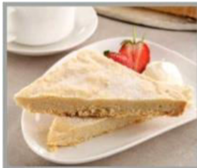
All Butter Shortbread Triangle 1 x 12 £11.50 £0.96