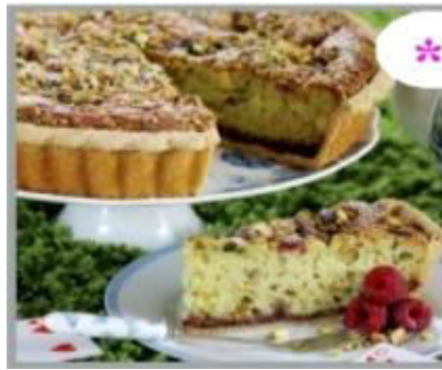
Raspberry & Pistachio Frangipan 1 x 14 (Pre/Ptn) £17.50 £1.25