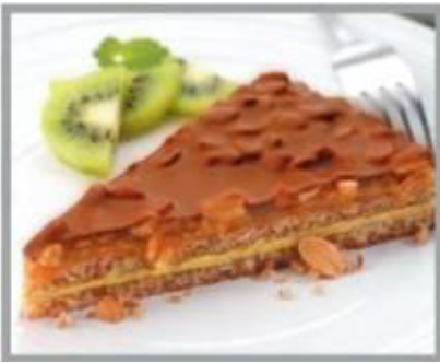
Peanut & Caramel Cake Gluten Free 1 x 12 (Pre/Ptn) £13.90 £1.16