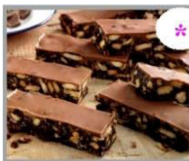
Chocolate Tiffin Slices 1 x 18 £18.90 £1.05