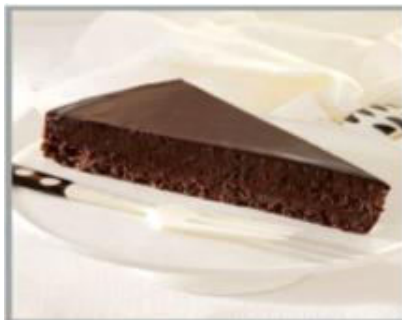
Flourless Chocolate Torte 1 x 16 £20.49 £1.28