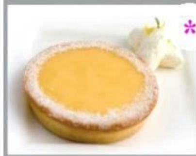
Tart au Citron 1 x 16 £22.95 £1.43