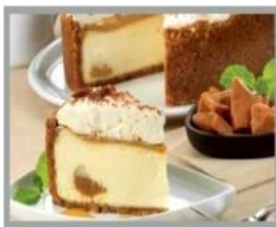
Banoffi Cookie Crust Cheesecake 1 x 14 (Pre/Ptn) £19.20 £1.37