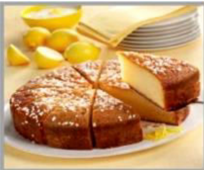
Lemon Drizzle Cake 1 x 14 (Pre/Ptn) £15.50 £1.11