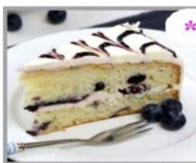
Blueberry Burst Cake 1 x 14 (Pre/Ptn) £13.50 £0.96