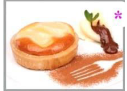
Sweet Pear Frangipane Tart 1 x 16 £22.95 £1.43