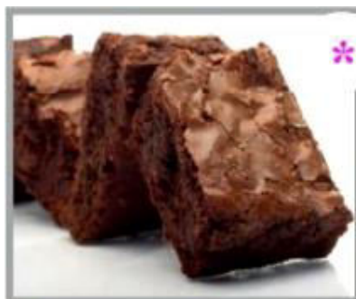
Chocolate Fudge Brownie Squares 1 x 15 £17.90 £1.19