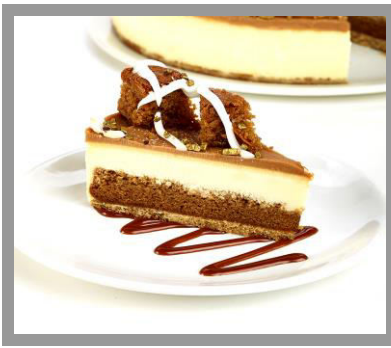
Gingerbread Sparkle Cheesecake 1 x 14 £20.50 £1.46