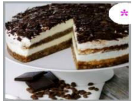
Tiramisu Sorrento 1 x 14 (Pre/Ptn) £18.90 £1.35