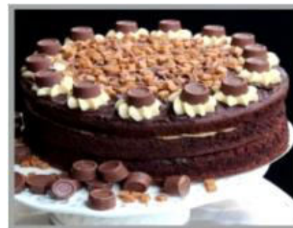
Chocolate & Rolo Triple Layer Cake 1 x 14 £16.90 £1.21