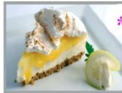
Lemon Pavlova Cheesecake 1 x 12 (Pre/Ptn) £18.75 £1.56