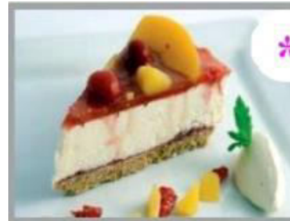
Peach Melba Cheesecake 1 x 12 (Pre/Ptn) £18.75 £1.56