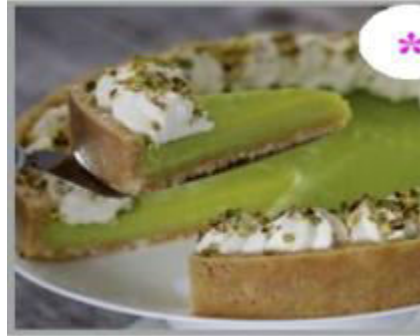
Key Lime Pie 1 x 12 (Pre/Ptn) £13.90 £1.16