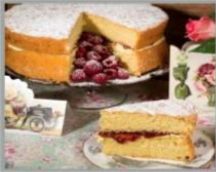
Victoria Vanilla Sponge 1 x 14 £15.90 £1.14

For more information or for your order simply call L Lewis: Tel: 01244 323624