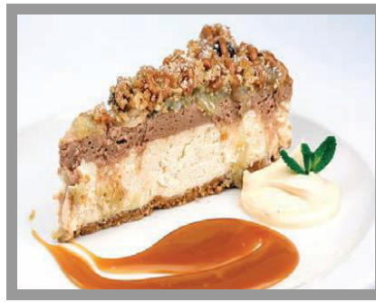
Gooseberry Toffee Crunch 1 x 14 (Pre/Ptn) £18.75 £1.34