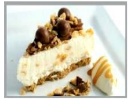
Honeycombe Cheesecake 1 x 12 (Pre/Ptn) £18.75 £1.56