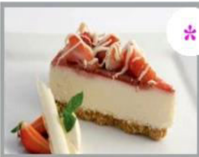
Strawberry & White Choc' Cheesecake 1 x 12 (Pre/Ptn) £18.75 £1.56