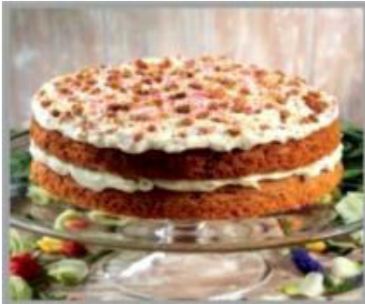
Hummingbird Cake 1 x 14 (Pre/Ptn) £16.50 £1.18