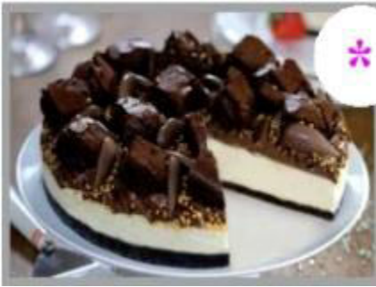
Triple Choc' Cheesecake Gluten Free 1 x 14 £21.90 £1.56