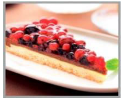
Red Fruits Tart 1 x 12 (Pre/Ptn) £16.90 £1.41