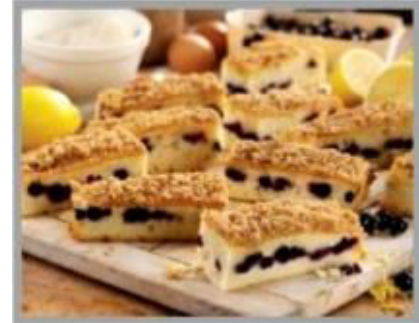
Lemon & Blackcurrant Drizzle Slices 1 x 18 £17.90 £0.99