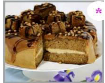
Sticky Salted Caramel Cake 1 x 14 (Pre/Ptn) £17.90 £1.28