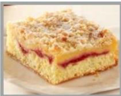
Lemon Raspberry Crumb Bar 1 x 16 £19.50 £1.22