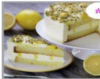
Lemon Syllabub & Pistachio Torte 1 x 14 (Pre/Ptn) £17.90 £1.28