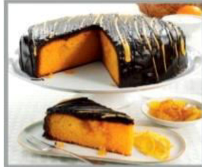
Sticky Chocolate & Orange Cake 1 x 14 (Pre/Ptn) £15.50 £1.11