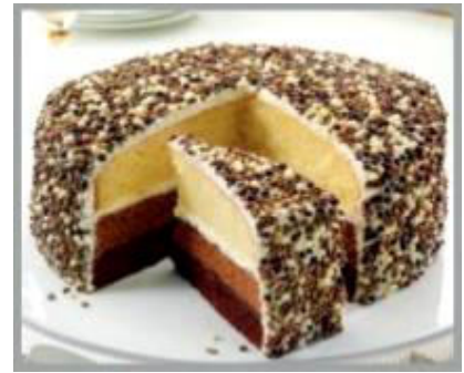
Triple Chocolate Sparkle Cake 1 x 14 (Pre/Ptn) £17.00 £1.21