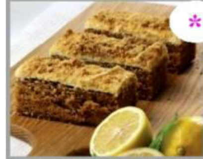
Ginger & Lemon Crumble Slices 1 x 18 £17.50 £0.97