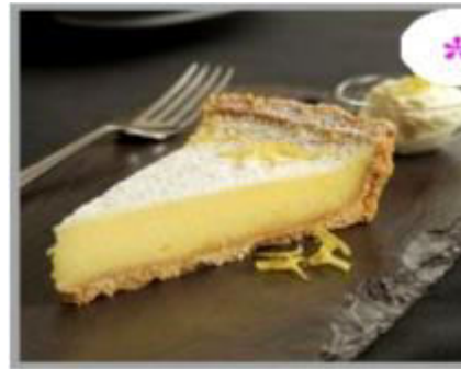
Lemon Panacotta Tart 1 x 12 (Pre/Ptn) £13.90 £1.16