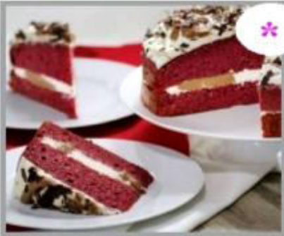
Red Velvet Ganache Cake 1 x 14 Cake (Pre/Ptn) £15.50 £1.11