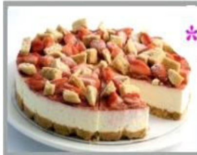
Strawberry Shortbread Cheesecake 1 x 12 (Pre/Ptn) £18.75 £1.56