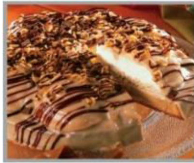
Toffee Lumpy Bumpy 1 x 12 (Pre/Ptn) £18.50 £1.54