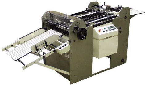
240 and 240XL Series