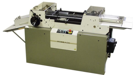
True-Line SR Series