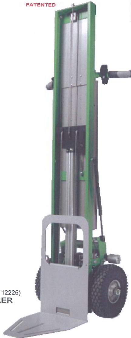
(order nr. 12225) M-TILLER