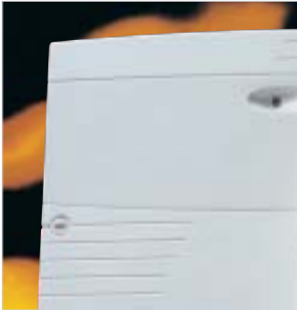
5VA Flame Retardant Housing