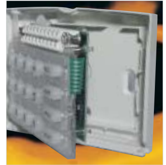
Hinged PCB Chassis