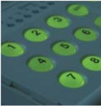
Touchtone Backlit Keys