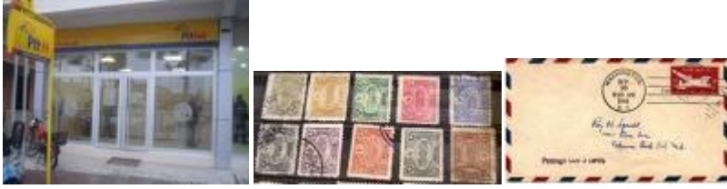
resim 15 -17