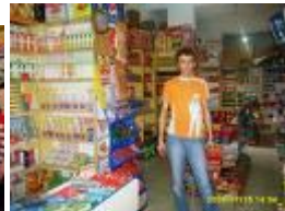
resim 6 & 7