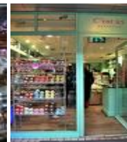
resim 8 & 9