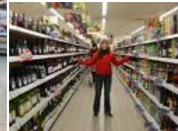
resim 4 & 5